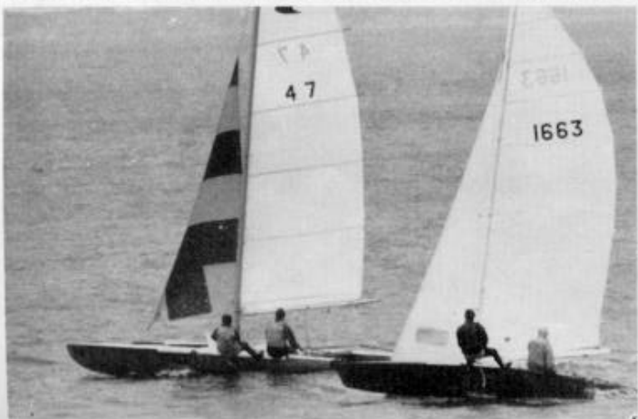
TOP: Thai-foon II, a modern version of a standard Thai.