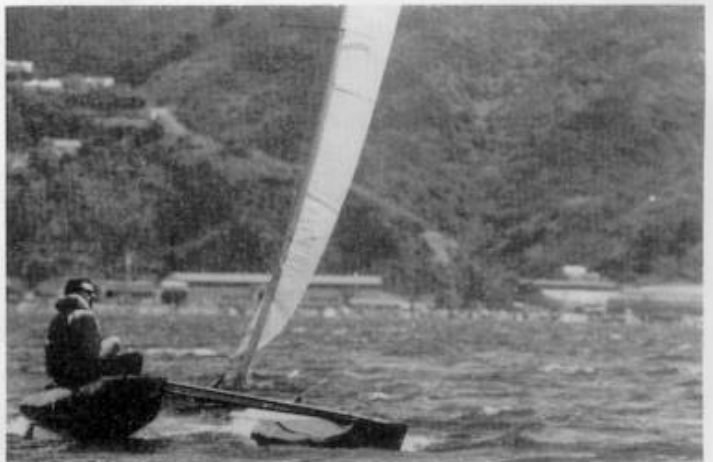
TOP: Very little wind at the start but Iolanthe II leads from 007 III and Typsy Myth.